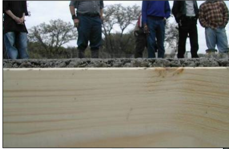
3/8" Riser Strips