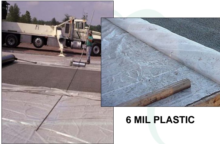
6 MIL PLASTIC